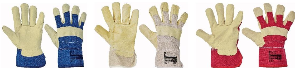
090 blue-yellow (size 9) 100 yellow (size 10) 110 red-yellow (size 110)